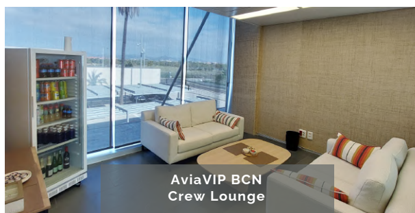
AviaVIP BCN Crew Lounge